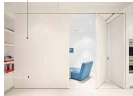
Custom pivoting pocket doors from Hafele, which slide 90 degrees, easily convert a room into two, maximizing flexibility in the snug space

Euda Construction played with perception in the tight space of the University Place apartment. "The contractor must have the sensibility and sophistication to instinctively understand the use of materials or palettes of the design, which leads to more refined solutions," says Eugeni Li, Euda's owner. Li played a key role in making sure the apartment's open plan maximized flexibility, adding in the space's smart track walls. "The open plan design was given even more flexibility by using sliding division walls, which dramatically change the rooms in seconds," adds Li.