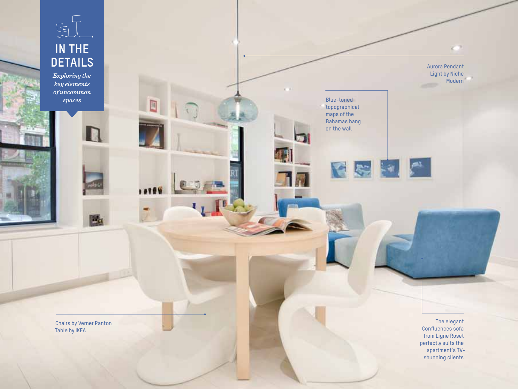
Aurora Pendant Light by Niche Modern

Exploring the key elements of uncommon spaces