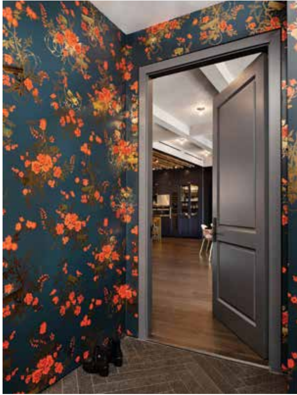
A FLORAL WALLPAPER BY FLAVOR PAPER IN THE ENTRY CHEEKILY SHOWCASES SECURITY CAMERAS — A CUSTOM ADDITION DESIGNED TO ELICIT A CHUCKLE.